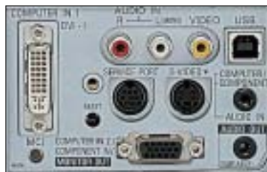
PLC-SU51 Terminal Input Panel